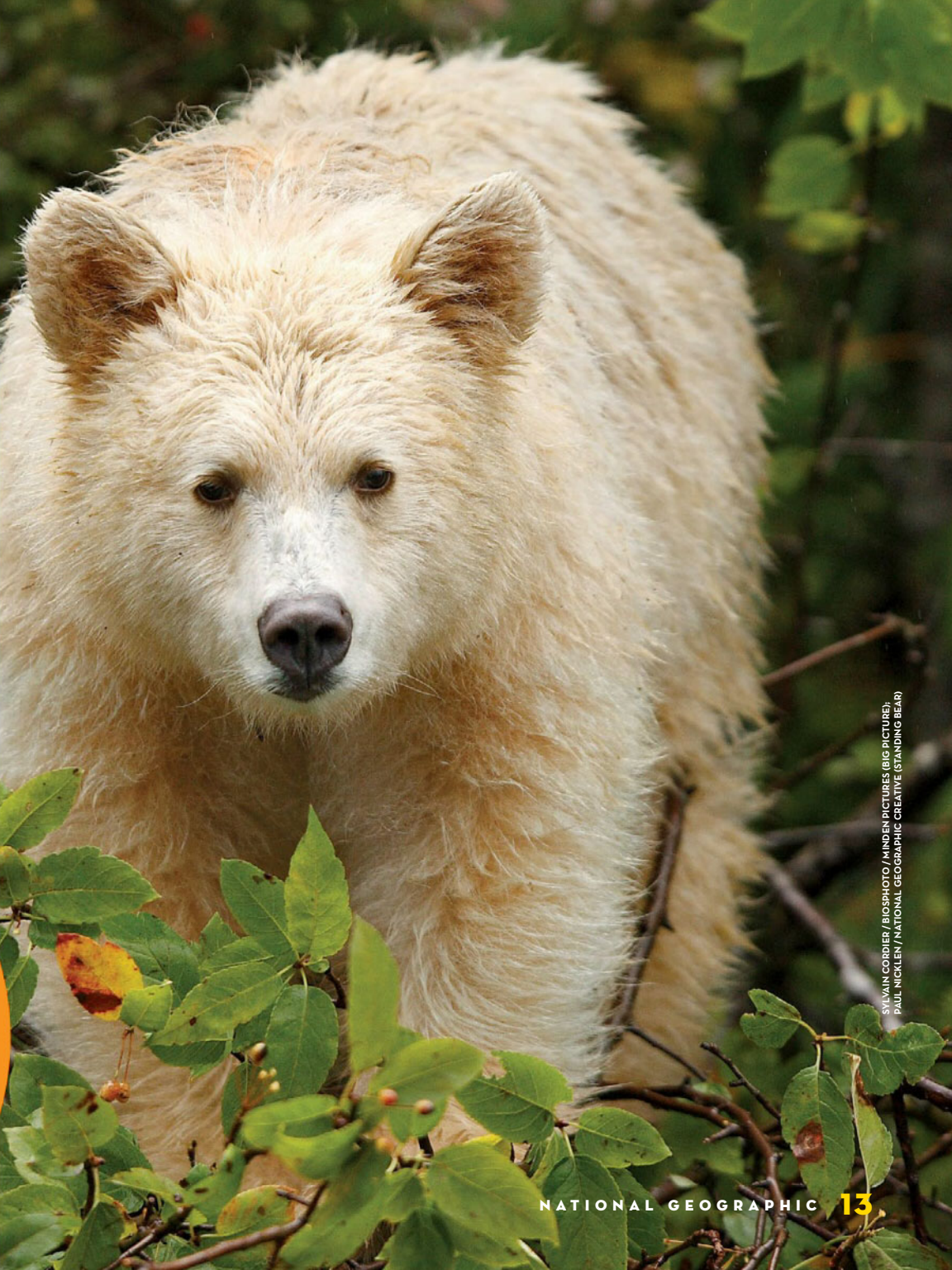
SWAN COPPER / BIGSHOTO / MINDEN PICTURES (BIG PICTURE); PAUL NICKLE / NATIONAL GEOGRAPHIC CREATIVE (STANDING BEAR)