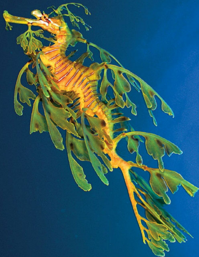
LEAFY SEA DRAGON