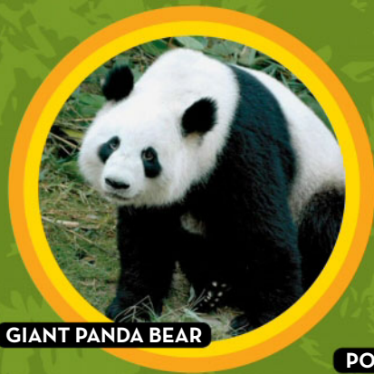
GIANT PANDA BEAR